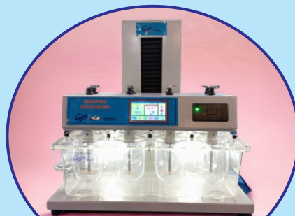
Dissolution Test Apparatus 8 Vessel